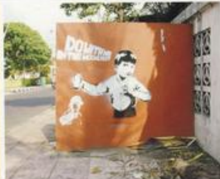
1st row lr: TAGS ON RYDER'S MURAL & GRAFFITI UNDER ALICIA'S MURAL 2nd row lr: LOCAL YOGYA'S STENCIL GRAFFITIES- UNKNOWN ARTISTS