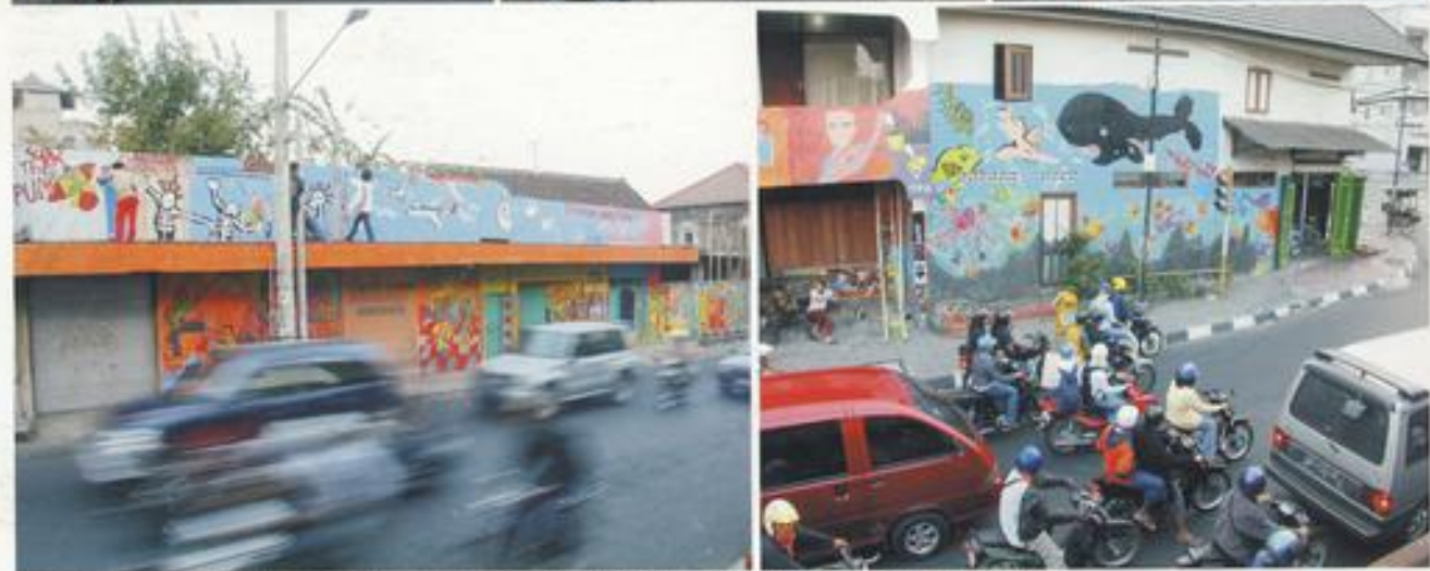
1st-2nd-3rd row: MURAL PROJECT BY LOCALS AROUND THEIR NEIGHBORHOOD INVOLVING MAN, WOMAN AND CHILDREN SHORT AFTER THE MURAL PROJECT SAMA-SAMA TOGETHER