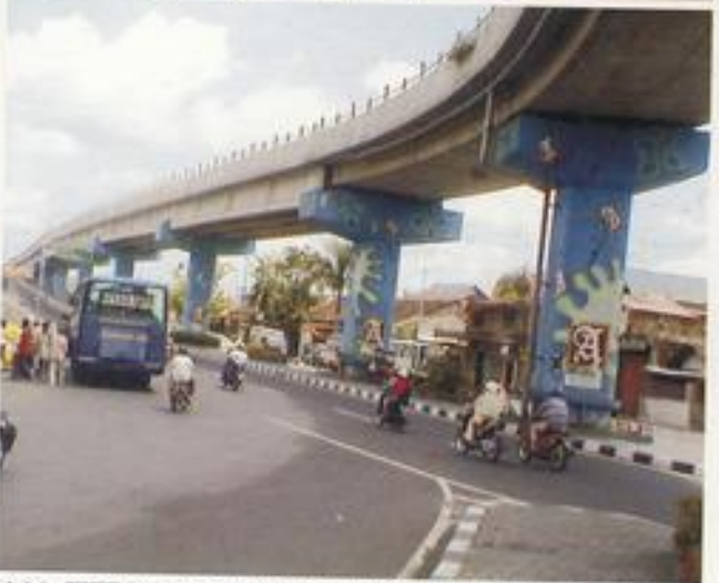
stockwell: REPETITIVE AND GIGANTIC MURALS PAINTED BY CIGARETTE COMPANY TO ADVERTISE THEIR PRODUCTS A CROSS HOYAKARTTA CITY WHILE SAN FRANCISCO PROJECT WAS HAPPENING.