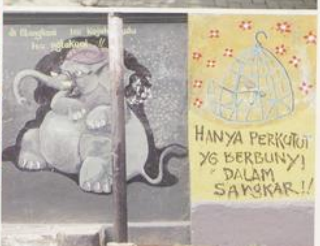
1st row 1st: GRAFFITI AROUND ALCI'S MURAL | MEGAN'S FLOWERS LOOK ALIKE 2nd row 1st: NEW MURAL FROM LOCAL YOGYA | MEGAN'S FLOWERS LOOK ALIKE 3rd row: STENCIL GRAFFITI MURAL | NEW MURAL RYKER'S BIRD CAGED LOOK ALIKE